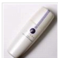
Tatcha Beauty Ritual