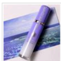
Watering the Skin with Tatcha Dewy Skin Mist