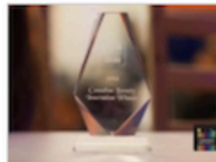
Canadian Beauty Innovation Award

BEST ANTI-AGING PRODUCT: Dermaquest. Dermaquest's Stem Cell 3D Luxury Collection boasts all of the brilliant discoveries they've made as the leaders in plant stem cell technology. With their complete 3D Ritual, you'll be immersed from head to toe in their most transforming and enchanting formulations, crafted to renew, repair and refine your skin with lavish intensity. Leave no stone unturned. Rejoice and indulge in the power of DermaQuest.